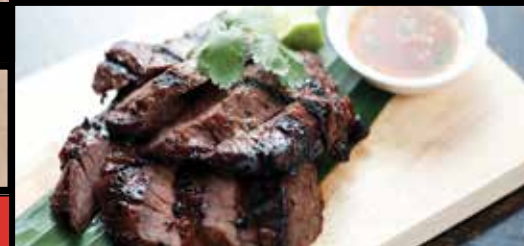
LAOS CHARCOAL CHICKEN 19.90