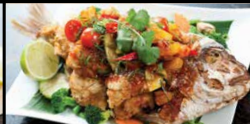
CRISPY FISH + SWEET, SOUR & SPICY SAUCE 48.90