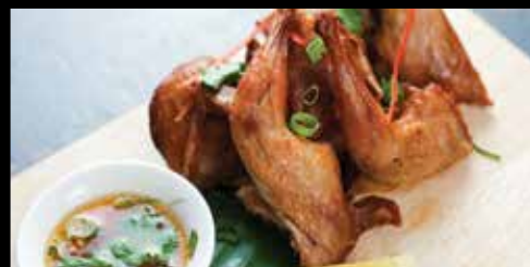
CRISPY MARINATED QUAILS 17.90