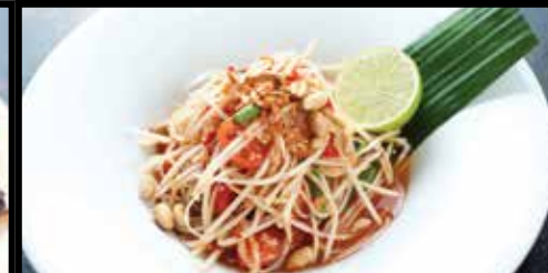
THAI PAPAYA SALAD (V) 17.90