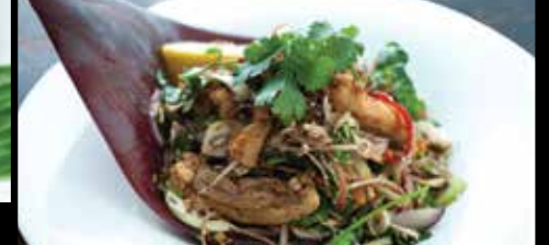
CRISPY CHICKEN AND BANANA BLOSSOM SALAD 18.90