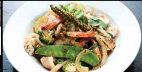
GARLIC & PEPPERCORN