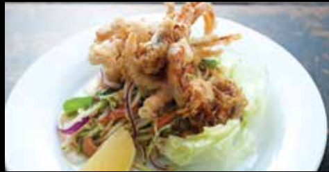
SOFT SHELL CRAB & GREEN MANGO SALAD 23.90