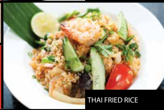
THAI FRIED RICE

Veges: $17.90. Beef, Chicken, Lamb, Pork: $19.90. King Prawn, Seafood, Combination: $22.90. Jumbo Prawn: $26.90