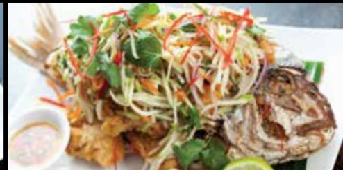
FRESH CRISPY SNAPPER + MANGO SALAD 48.90