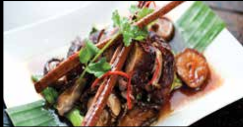
ROAST DUCK IN HOLY BASIL PLUM SAUCE 28.90