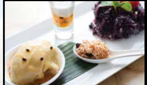
STICKY COCONUT RICE PUDDING + DURIAN $18.90

Prices subject to change without notice.