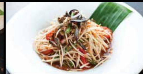
LAOS PAPAYA SALAD (Anchovies) 17.90