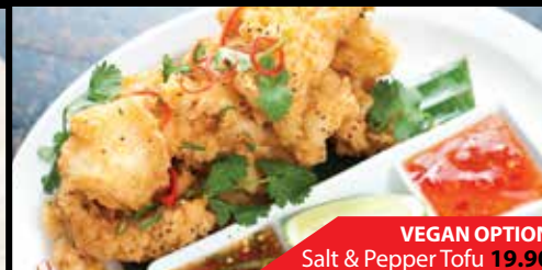
SALT & PEPPER CALAMARI 12.90