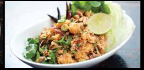
NEM KHAO RICE & CURED PORK SALAD 18.90