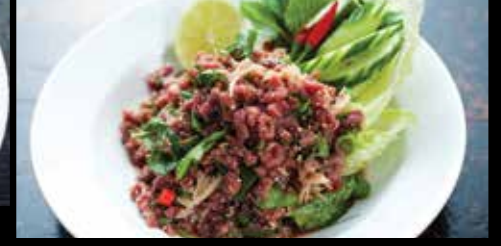
TARTE BEEF SALAD (RAW) 18.90