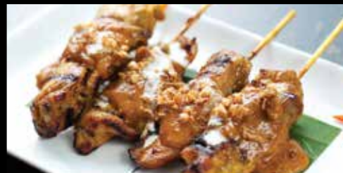
SATAY CHICKEN SKEWERS 13.90