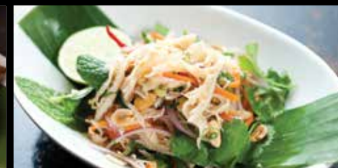
BEEF TRIPE SALAD 18.90