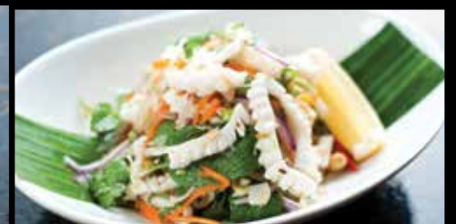
CALAMARI SALAD 17.90

(V) Vegetarian. Please advise staff of dietary requirements.