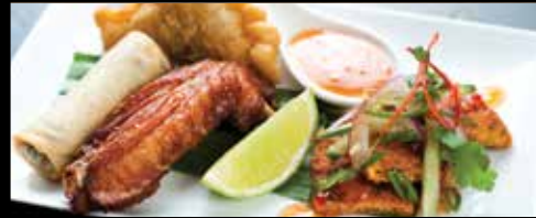
MIXED APPETISERS 12.90