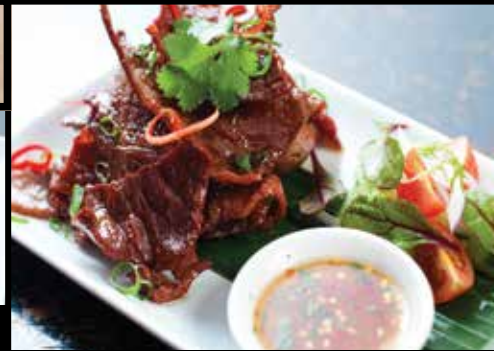
MARINATED DRY BEEF 17.90