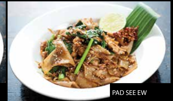
PAD SEE EW