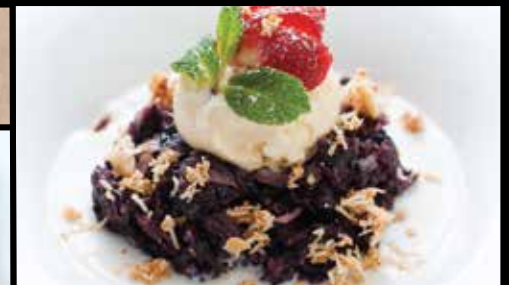
BLACK HARBOUR $15.90