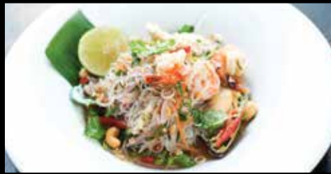
HOT & SOUR VERMICELLI WITH MIXED SEAFOOD 21.90