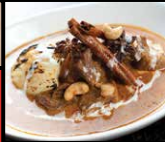
BEEF MASAMAN CURRY 22.90

Veges: $17.90. Beef, Chicken, Lamb, Pork: $19.90. King Prawn, Seafood, Combination: $22.90. Jumbo Prawn: $26.90