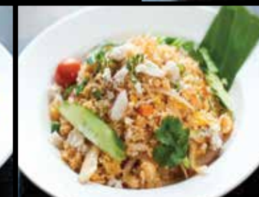
CRAB MEAT FRIED RICE 23.90