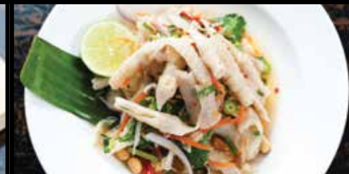
CHICKEN FEET SALAD 18.90