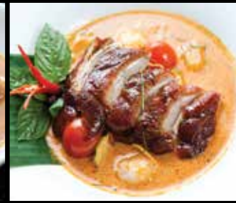
ROAST DUCK CURRY (RED) 24.90