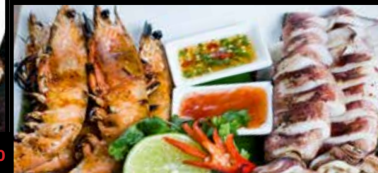
SEAFOOD MIXED GRILL 36.90