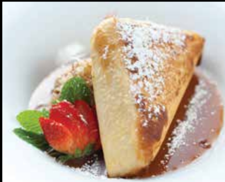
HOLY BASIL FRIED ICE CREAM $17.90