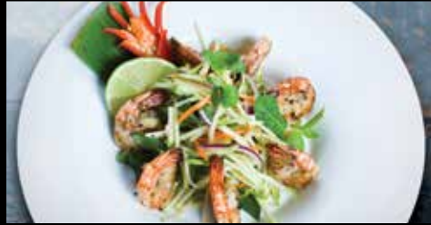
GRILLED KING PRAWN & GREEN MANGO SALAD 21.90