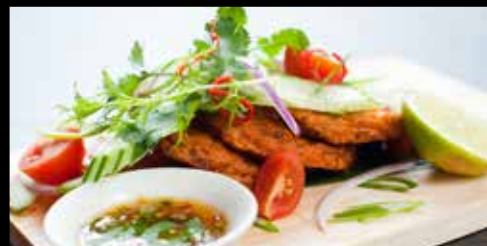
FISH CAKES 12.90