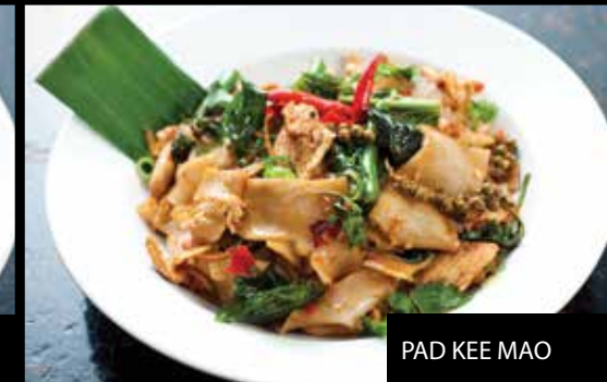
PAD KEE MAO