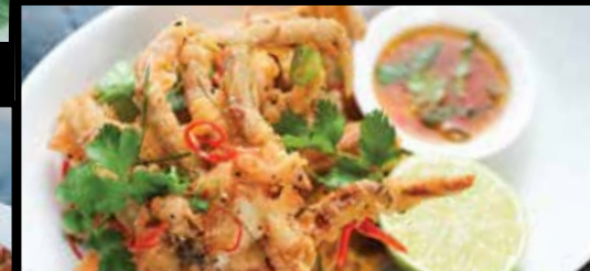
SOFT SHELL CRAB 26.90