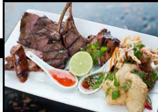
SURF & TURF 38.90