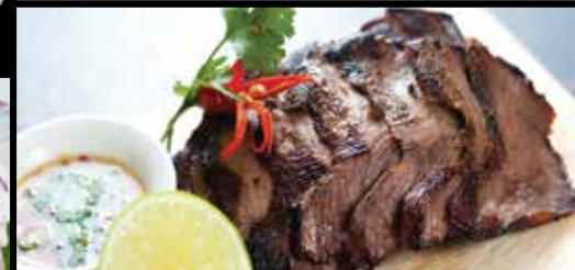
OX TONGUE 19.90