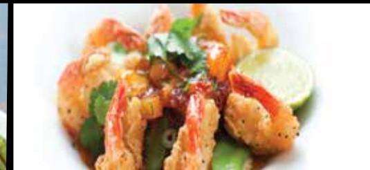
THAI KING PRAWNS 22.90