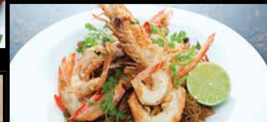
JUMBO PRAWNS IN VERMICELLI NOODLES 28.90