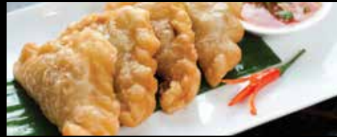
HOME MADE CURRY PUFFS (V) 12.90