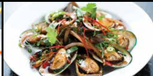
HOLY BASIL MUSSELS 19.90