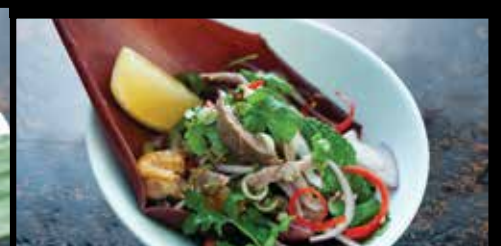
ROAST DUCK SALAD 21.90