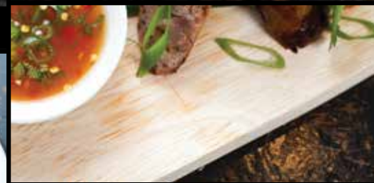
LAOS PORK SAUSAGES 18.90