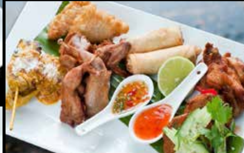
APPETISER "THE LOT" 24.90