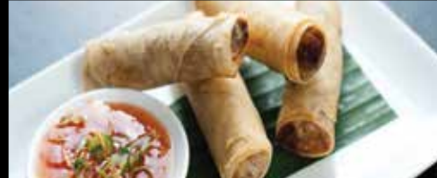
HOME MADE SPRING ROLLS (V) 12.90