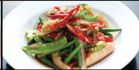
FRESH CHILLI SAUCE