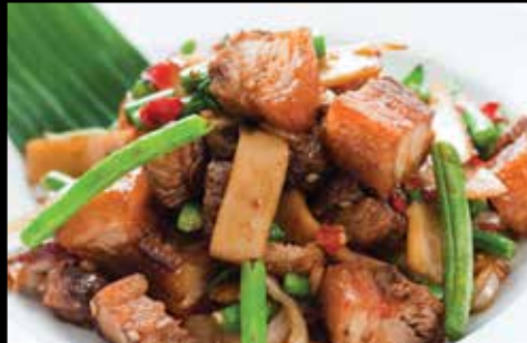
ROAST PORK BELLY IN CHILLI BASIL & GARLIC SAUCE 28.90