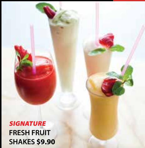
SIGNATURE FRESH FRUIT SHAKES $9.90