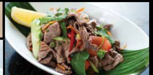
THAI BEEF SALAD 18.90