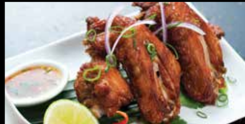
CRISPY CHICKEN WINGS 12.90