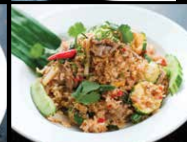
HOLY BASIL FRIED RICE