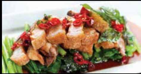
ROAST PORK BELLY IN OYSTER SAUCE 28.90