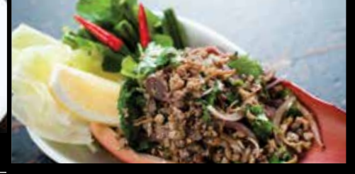
DUCK MINCE SALAD 18.90