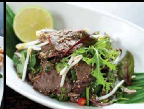
TIGER BEEF SALAD 18.90