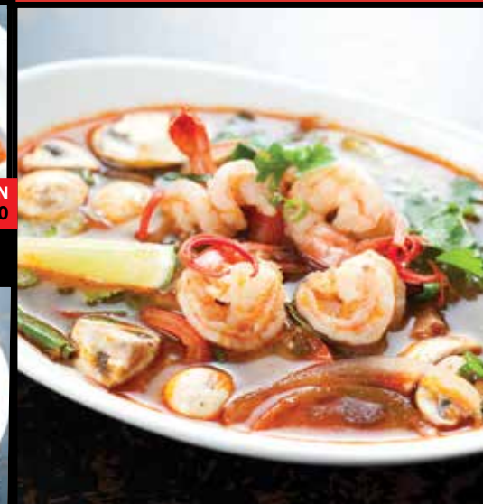
TOM YUM HOT & SOUR SOUP

Veges: $17.90. Beef, Chicken, Lamb, Pork: $18.90. King Prawn, Seafood, Combination: $21.90. Jumbo Prawn: $26.90