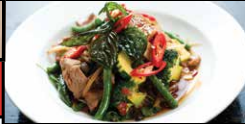
CHILLI, BASIL & GARLIC SAUCE

Veges: $17.90. Beef, Chicken, Lamb, Pork: $19.90. King Prawn, Seafood, Combination: $22.90. Jumbo Prawn: $26.90