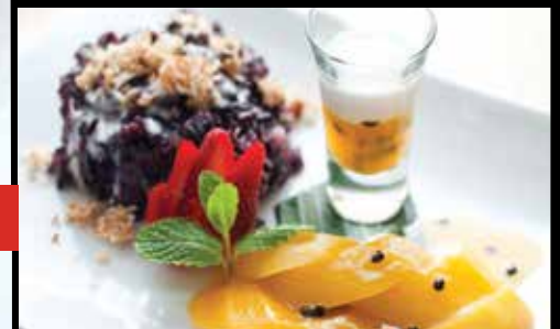
STICKY COCONUT RICE PUDDING + MANGO $17.90