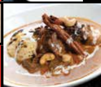
BEEF MASAMAN CURRY 22.90

Veges: $17.90. Beef, Chicken, Lamb, Pork: $19.90. King Prawn, Seafood, Combination: $22.90. Jumbo Prawn: $26.90