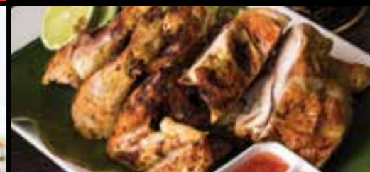
MARINATED LAMB CUTLETS 34.90