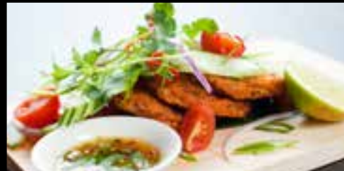
FISH CAKES 12.90