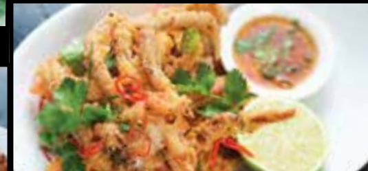
SOFT SHELL CRAB 26.90