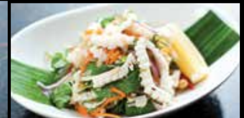
CALAMARI SALAD 17.90

(V) Vegetarian. Please advise staff of dietary requirements.