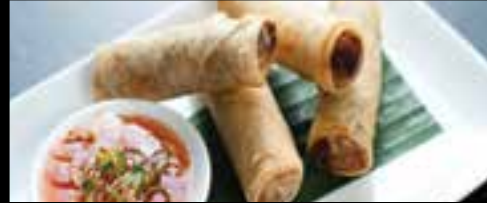
HOME MADE SPRING ROLLS (V) 12.90