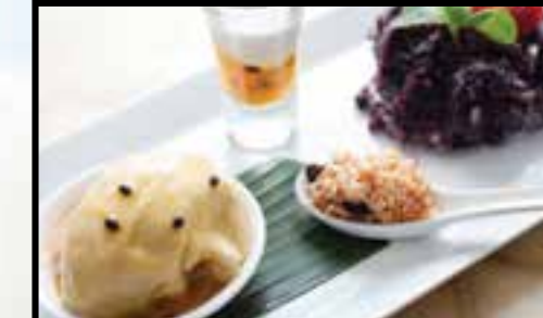
STICKY COCONUT RICE PUDDING + DURIAN $18.90

(V) Vegetarian. Please advise staff of dietary requirements.