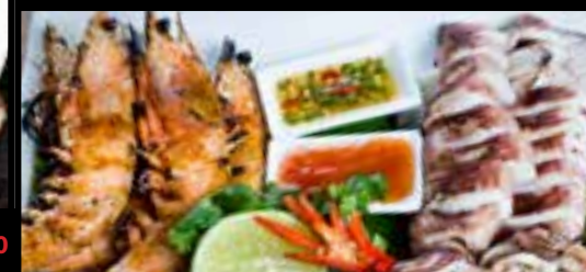
SEAFOOD MIXED GRILL 36.90