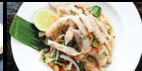
CHICKEN FEET SALAD 18.90