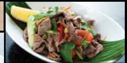
THAI BEEF SALAD 18.90