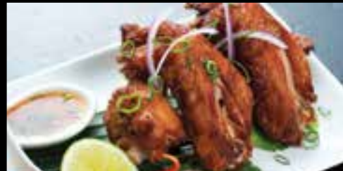
CRISPY CHICKEN WINGS 12.90