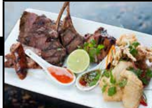
SURF & TURF 44.90