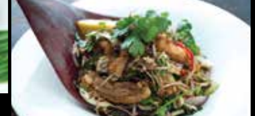
CRISPY CHICKEN AND BANANA BLOSSOM SALAD 18.90