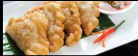
HOME MADE CURRY PUFFS (V) 12.90