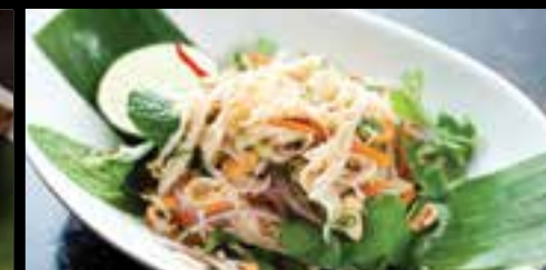
BEEF TRIPE SALAD 18.90