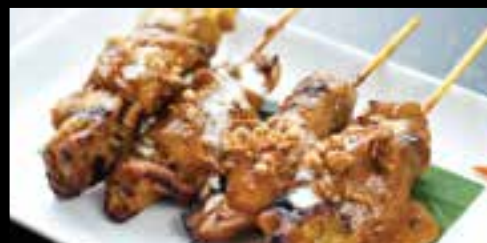
SATAY CHICKEN SKEWERS 13.90