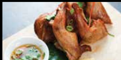
CRISPY MARINATED QUAILS 17.90