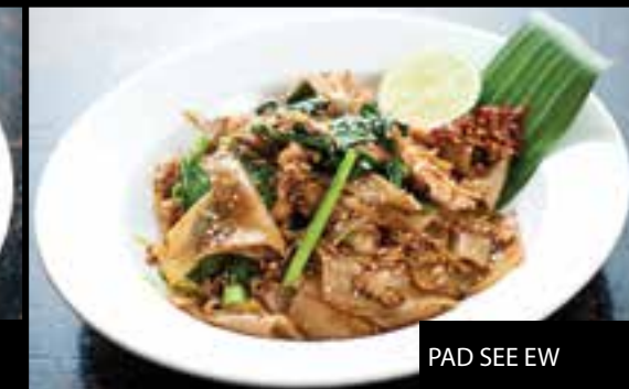
PAD SEE EW