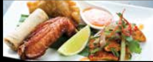
MIXED APPETISERS 12.90