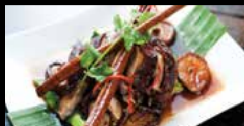
ROAST DUCK IN HOLY BASIL PLUM SAUCE 28.90