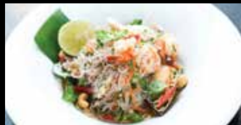
HOT & SOUR VERMICELLI WITH MIXED SEAFOOD 21.90