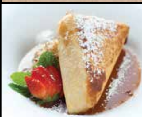
HOLY BASIL FRIED ICE CREAM $17.90