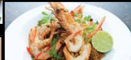
JUMBO PRAWNS IN VERMICELLI NOODLES 28.90