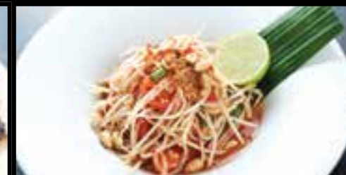
THAI PAPAYA SALAD (V) 17.90