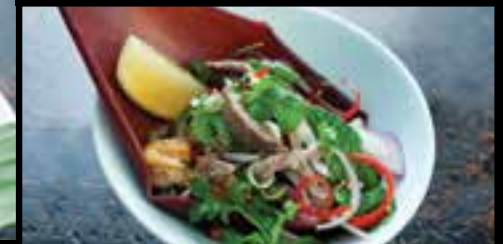
ROAST DUCK SALAD 21.90