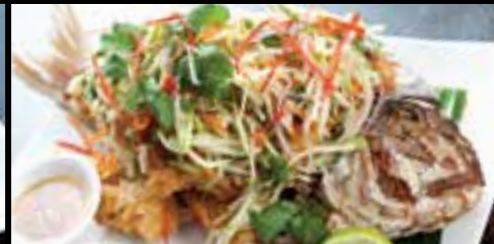
FRESH CRISPY SNAPPER + MANGO SALAD 48.90