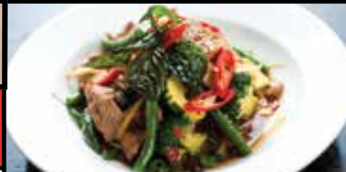
CHILLI, BASIL & GARLIC SAUCE

Veges: $17.90. Beef, Chicken, Lamb, Pork: $19.90. King Prawn, Seafood, Combination: $22.90. Jumbo Prawn: $26.90