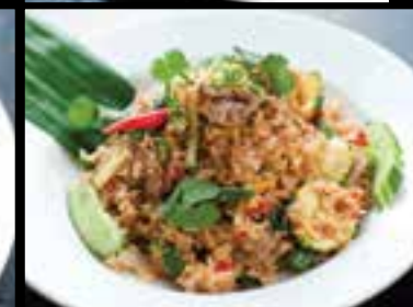
HOLY BASIL FRIED RICE