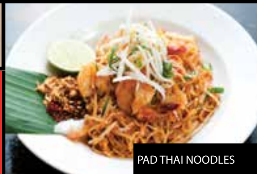
PAD THAI NOODLES

Veges: $17.90. Beef, Chicken, Lamb, Pork: $19.90. King Prawn, Seafood, Combination: $22.90. Jumbo Prawn: $26.90