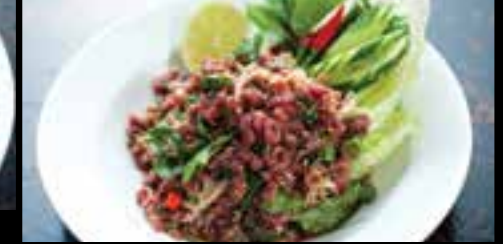
TARTE BEEF SALAD (RAW) 18.90