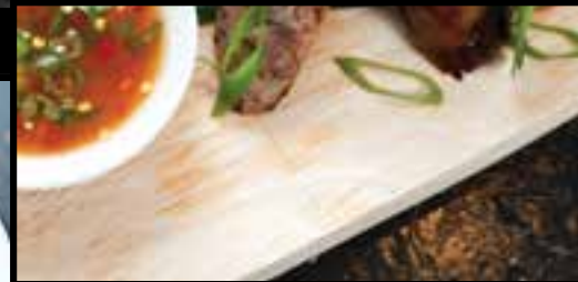
LAOS PORK SAUSAGES 18.90