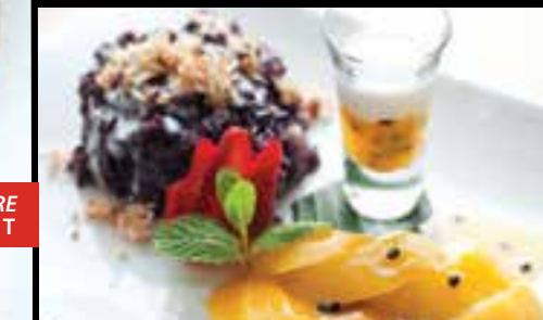
STICKY COCONUT RICE PUDDING + MANGO $17.90