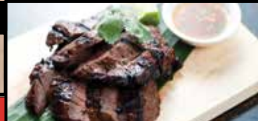
LAOS CHARCOAL CHICKEN 19.90