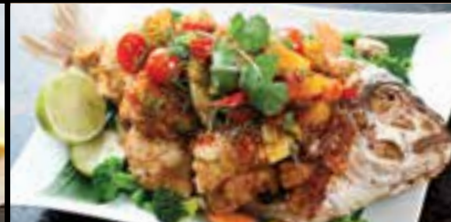
CRISPY FISH + SWEET, SOUR & SPICY SAUCE 48.90