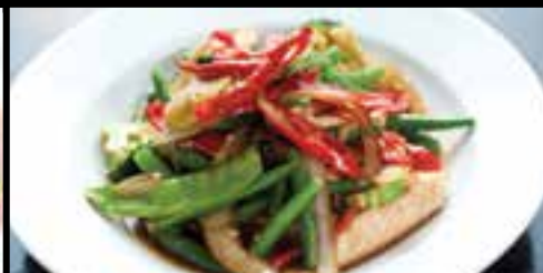
FRESH CHILLI SAUCE