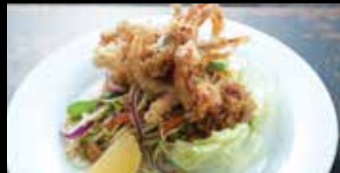
SOFT SHELL CRAB & GREEN MANGO SALAD 23.90