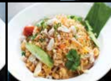
CRAB MEAT FRIED RICE 23.90