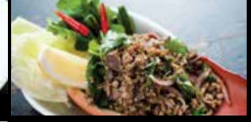
DUCK MINCE SALAD 18.90