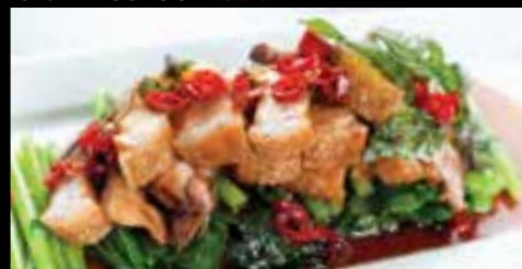
ROAST PORK BELLY IN OYSTER SAUCE 28.90