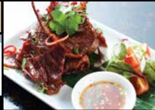
MARINATED DRY BEEF 17.90