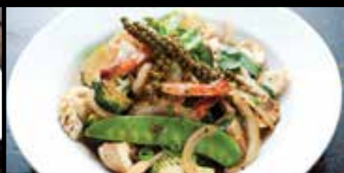
GARLIC & PEPPERCORN