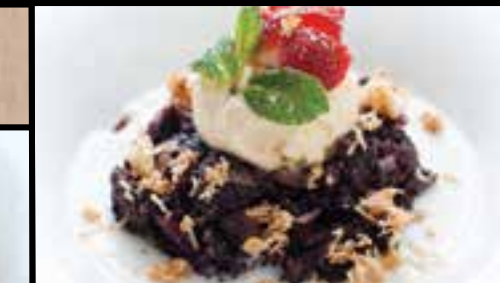
BLACK HARBOUR $15.90