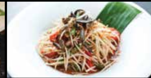
LAOS PAPAYA SALAD (Anchovies) 17.90