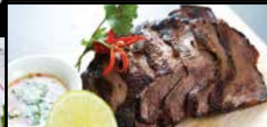
OX TONGUE 19.90