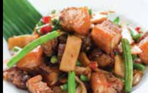
ROAST PORK BELLY IN CHILLI BASIL & GARLIC SAUCE 28.90