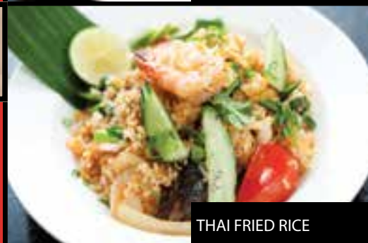
THAI FRIED RICE

Veges: $17.90. Beef, Chicken, Lamb, Pork: $19.90. King Prawn, Seafood, Combination: $22.90. Jumbo Prawn: $26.90