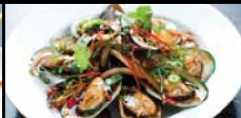
HOLY BASIL MUSSELS 19.90