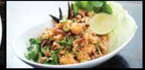
NEM KHAO RICE & CURED PORK SALAD 18.90