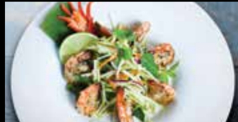
GRILLED KING PRAWN & GREEN MANGO SALAD 21.90