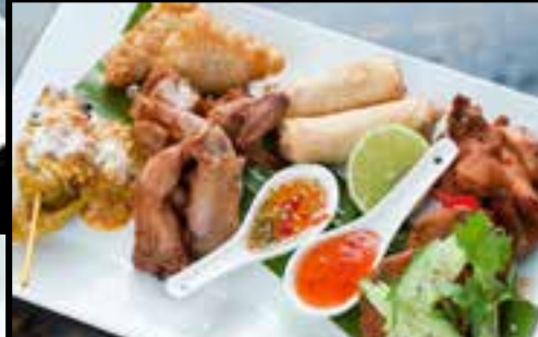
APPETISER "THE LOT" 28.90