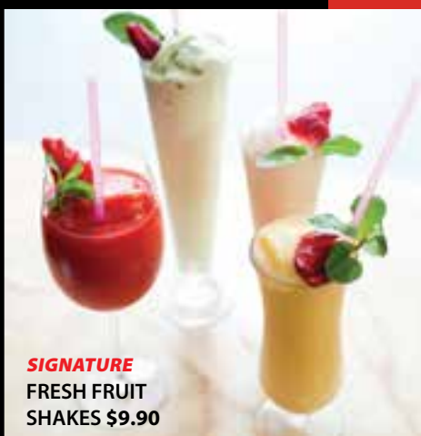
SIGNATURE FRESH FRUIT SHAKES $9.90