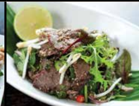
TIGER BEEF SALAD 18.90