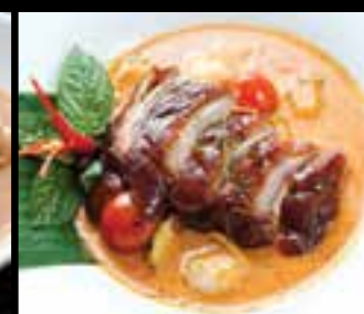
ROAST DUCK CURRY (RED) 24.90