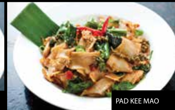
PAD KEE MAO