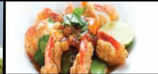
THAI KING PRAWNS 22.90